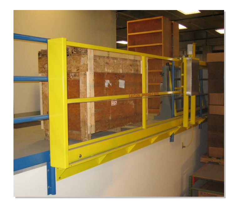
Automated Horizontal Sliding Mezzanine Pallet Gate

Because each industry handles material of different sizes, the horizontal sliding mezzanine pallet gate is manufactured to your specific width requirements and offers options which will enhance the productivity and safety of your facility and employees.